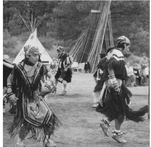
Bruno Boys May 2003