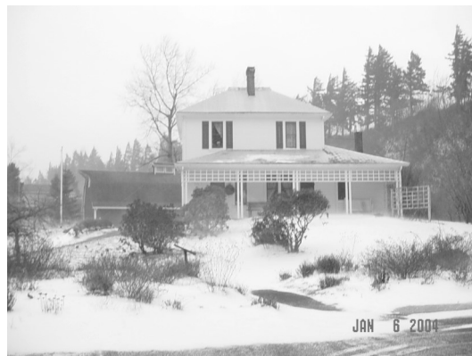
Harlow House Museum & Barn ... Taken January 6, 2004