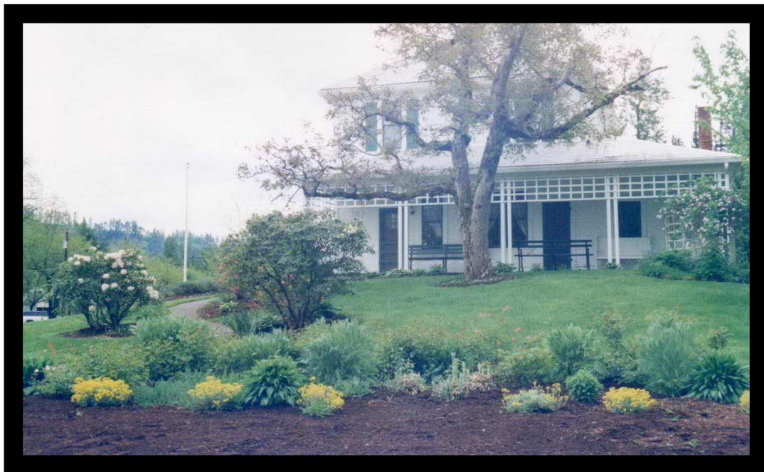
Three views of new landscaping at Harlow House and showing the English Walnut tree still in place in front

Remember: THS is a 501 c (3), so your donations are tax deductible and help support the museums, programs, preservation of artifacts and local history. Thank you for your continued support.